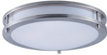
55542WTSN Linear LED Flush Mount