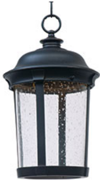
55029CDBZ Dover LED Outdoor Hanging Lantern