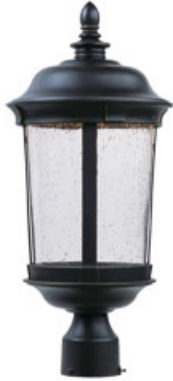
55021CDBZ Dover LED 3-Light Outdoor Post Lantern