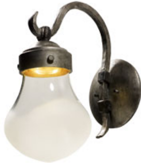
54472FGBS Rustica LED 1-Light Outdoor Wall Lantern