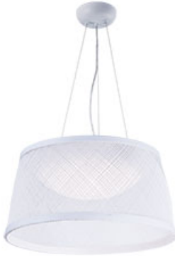
54374WT Bahama 1-Light Pendant