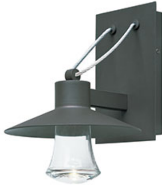
54360CLABZ Civic LED Outdoor Wall Lantern