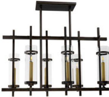
43746CLGB Midtown LED 6-Light Pendant