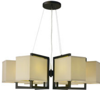
43556LNDBZ Baldwin 6-Light Pendant