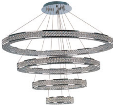
39778BCPC Eternity LED 12-Light Chandelier