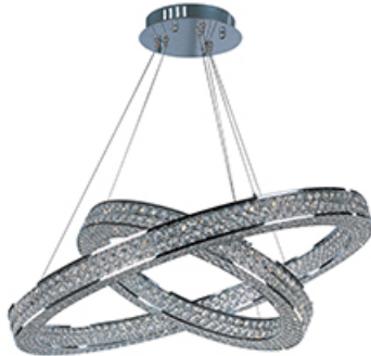
39777BCPC Eternity LED 6-Light Pendant