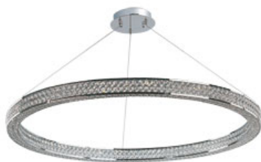
39774BCPC Eternity LED 3-Light Pendant