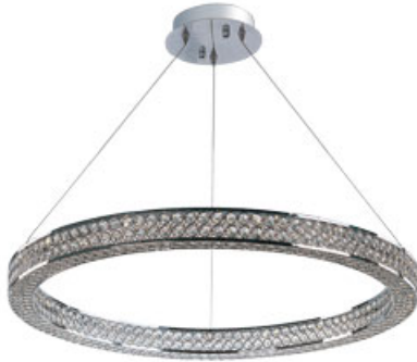
39773BCPC Eternity LED 3-Light Pendant