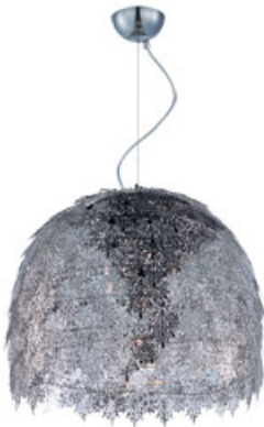
39764PC Vineyard 5-Light Pendant