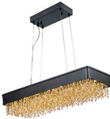
39659SHBZ Mystic 22-Light Chandelier