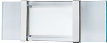
39635CLSN Image 1-Light Bath Vanity