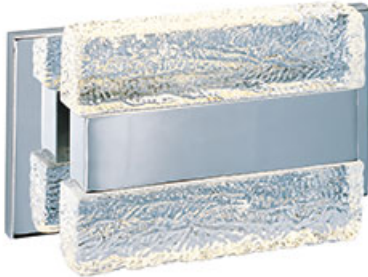
39621IBPC Ice 2-Light Bath Vanity