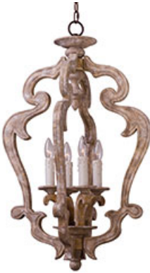
39603SW Olde World 4-Light Chandelier