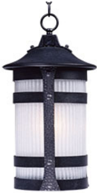
3129CONAR Casa Grande 1-Light Outdoor Pendant