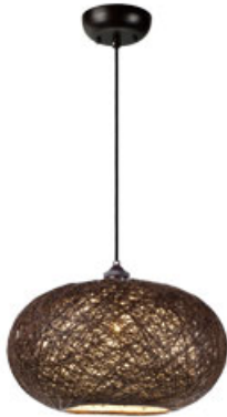
14402CHWT Bali 1-Light Chandelier