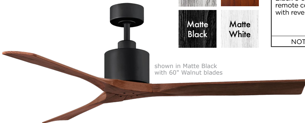
shown in Matte Black with 60" Walnut blades