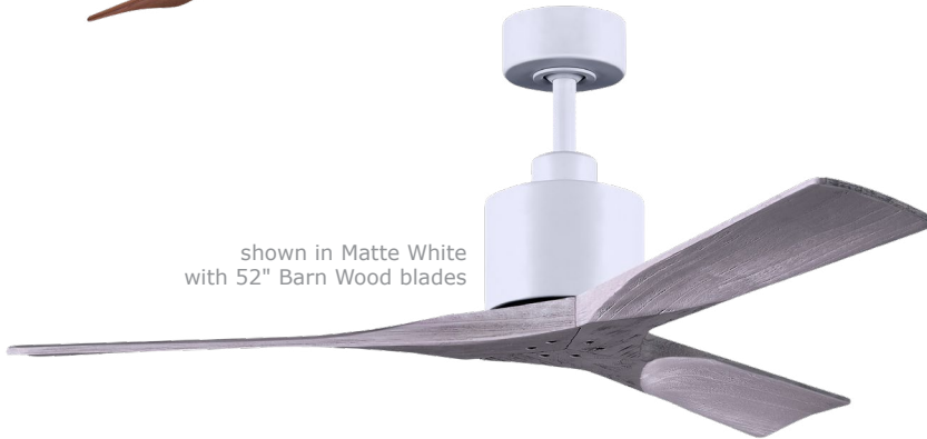
shown in Matte White with 52" Barn Wood blades