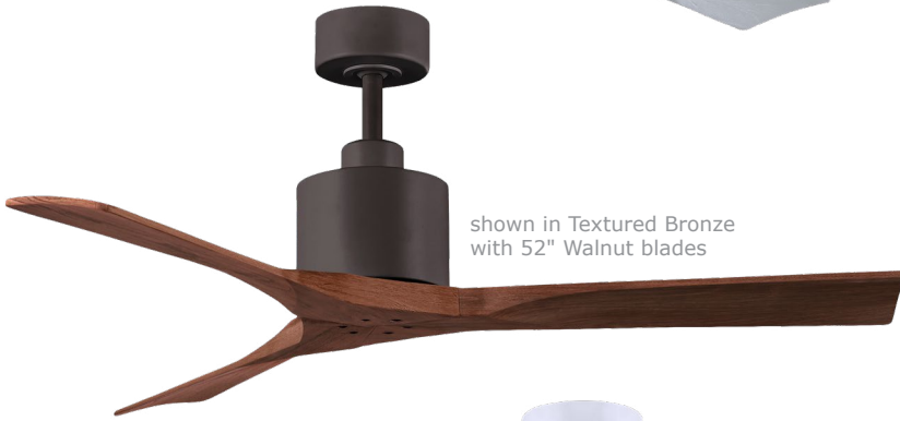
shown in Textured Bronze with 52" Walnut blades