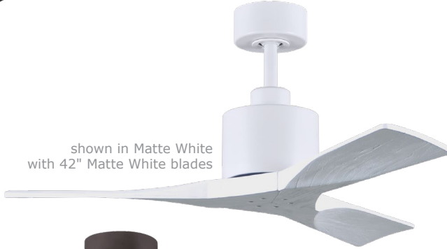
shown in Matte White with 42" Matte White blades