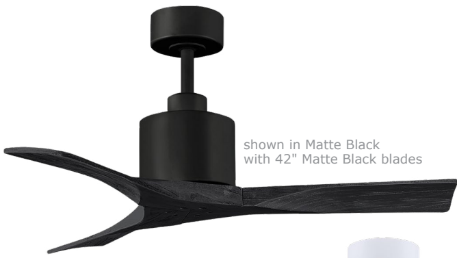
shown in Matte Black with 42" Matte Black blades