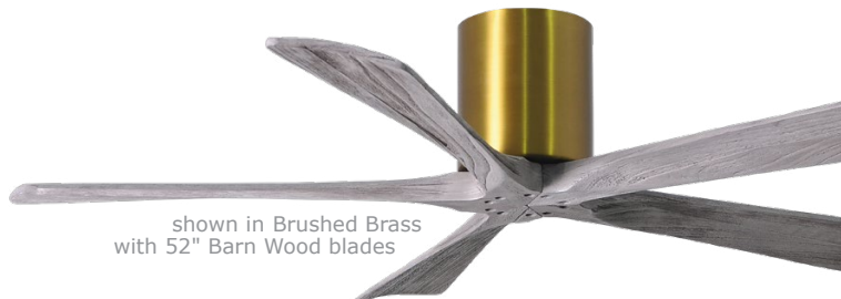
shown in Brushed Brass with 52" Barn Wood blades