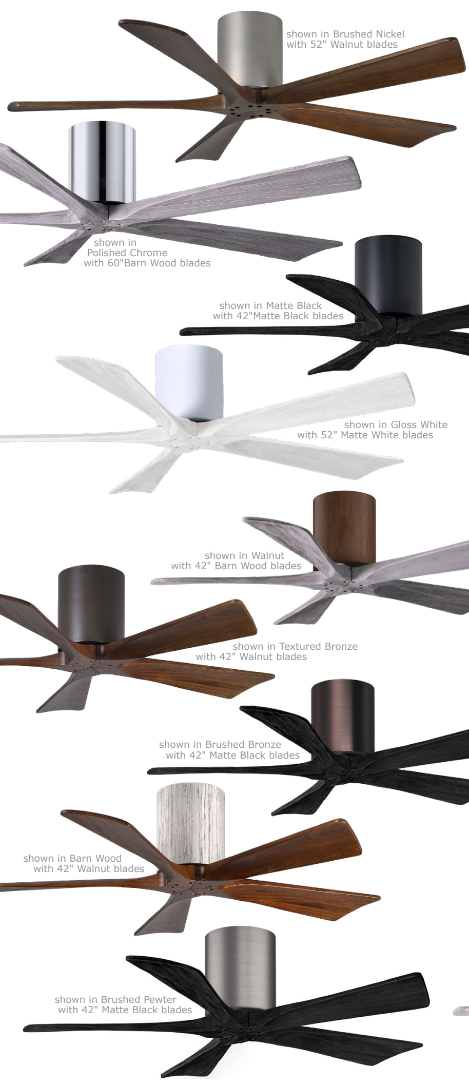
shown in Brushed Nickel with 52" Walnut blades