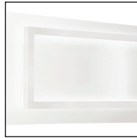
WH - White