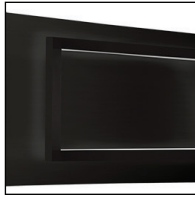
BK - Black