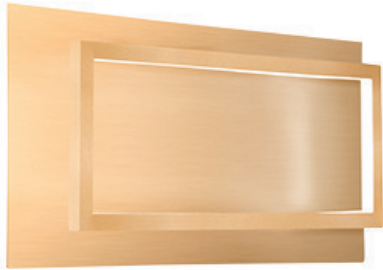
SG - Soft Gold