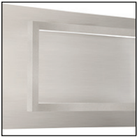
BN - Brushed Nickel