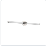
VL18532-BN Brushed Nickel