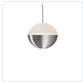
PD10502-BN Brushed Nickel

Single downward LED pendant with a stratum sphere shaped cast aluminum with matching heavy gauge frosted acrylic bottom diffuser. Patent pending fixture design with Kuzco SSL wire provided with our powerful 120V AC LED technology. Available metal finishes in matte black, brushed nickel or matte white. Upward and downward multi-pendant arrangements and wall sconces available see series for full family details.