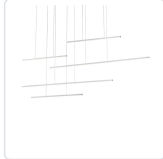
MP18363-BN Brushed Nickel