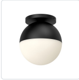
FM58310-BK/OP Black/Opal Glass