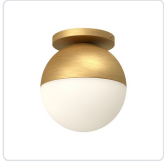
FM58310-BG/OP Brushed Gold/Opal Glass

One of our best-selling designs is the retro-style Monae Collection. These decadent orb-shaped lamps are available in a striking black or dazzling brushed gold finish that plays well with modern and retro décor. Available in three different-sized pendants with 120" cables or a luxurious flush mount option.