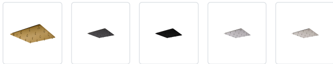
CNP16AC-BG Brushed Gold