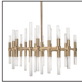
VB - Vintage Brass