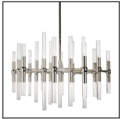
PN - Polished Nickel