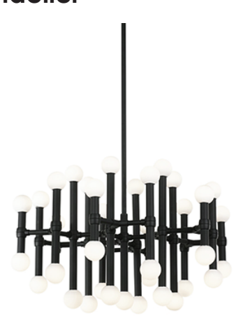
BL - Black Plating