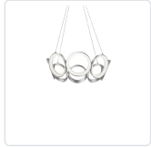
CH94824-AS Antique Silver

Die-cast aluminum rings with translucent acrylic diffusers. Metallic brushed or matte powder-coat finish. Outward emitting light. Custom options available.