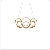
CH94824-AN Antique Brass