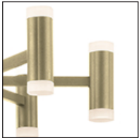
BB - Brushed Brass