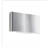
AT68010-BN Brushed Nickel