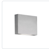
AT6606-BN Brushed Nickel