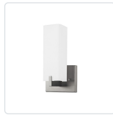
601485BN-LED Brushed Nickel