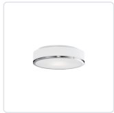
599002BN Brushed Nickel