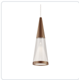
402401VB-LED Vintage Brass