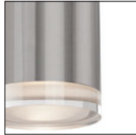
BN - Brushed Nickel