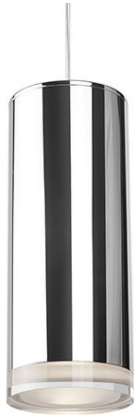
CH - Chrome