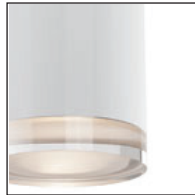
WH - White