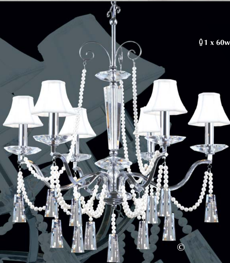
96016S2P-95 Crystal: IMPERIAL™ (-22) (pictured), Ø 6 x 60w, ↔ 29" (74cm) x ↓ 30" (76cm) Finish: Silver (S).

james r. moder BEVERLY HILLS · NEW YORK · PARIS · LONDON · TOKYO · VANCOUVER