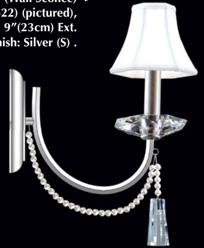
96011S2P-95 (Wall Sconce) → Crystal: IMPERIAL™ (-22) (pictured), Ø 1 x 60w, ↔ 5" (13cm) x ↓ 14" (36cm) x 9" (23cm) Ext. Finish: Silver (S) .