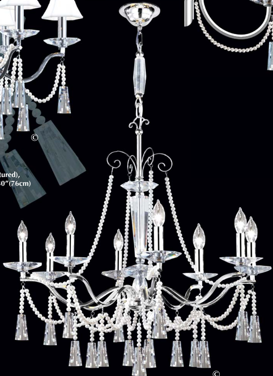
96018S2P Crystal: IMPERIAL™ (-22) (pictured), Ø 8 x 60w, ↔ 31" (79cm) x ↓ 35" (89cm) Finish: Silver (S).

(STRASS & ELEMENTS are now named Swarovski® crystals)