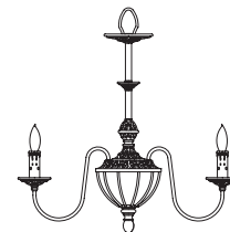
Drawing 1 - Fixture Assembly