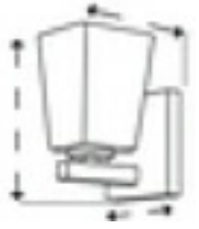
Image File Name: P4035-084.jpg