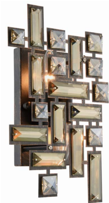
Dark Bronze Item No: V2100W12DB