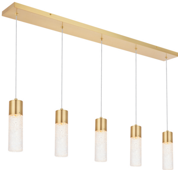
Gold Item No: 5200D42G