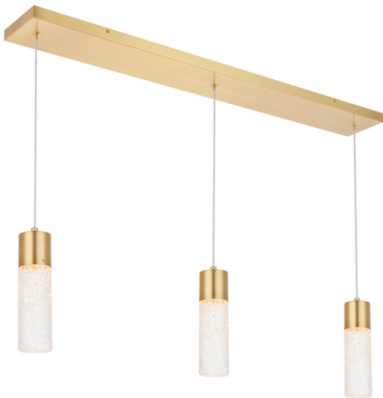
Gold Item No: 5200D36G