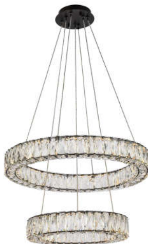
Black Item No:3503G24BK