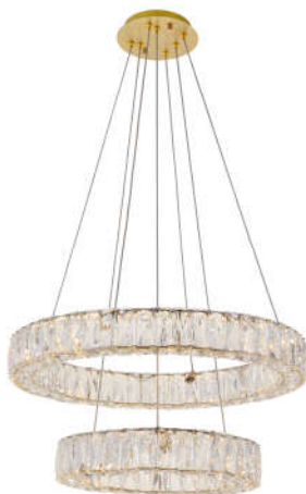
Gold Item No:3503G24G