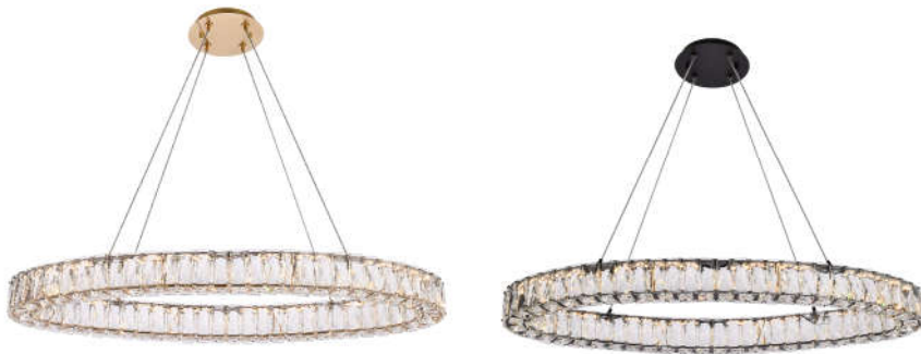
Satin Gold Item No:3503D36G