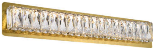
Gold Item No:3502W24G