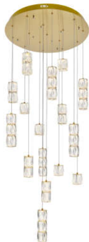
Gold Item No:3500D28G