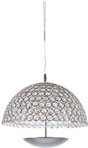
E24497-20PC Parosol 1-Light LED Pendant