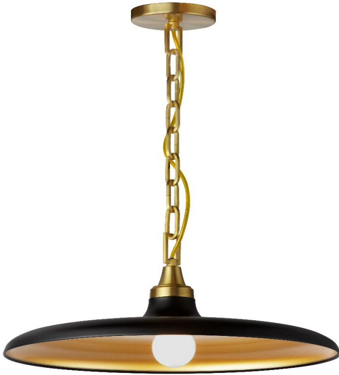
1 Light Incandescent Pendant Aged Brass with Matte Black & Gold Shade