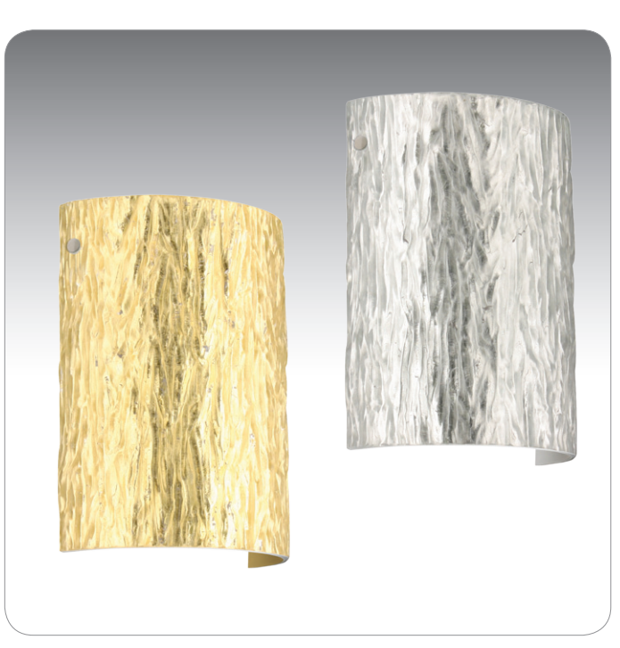
TAMBURO 8 SHOWN IN STONE GOLD FOIL (7090GF) & STONE SILVER FOIL (7090SF)

UL or ETL Listed. Suitable for Damp Locations (interior use only).